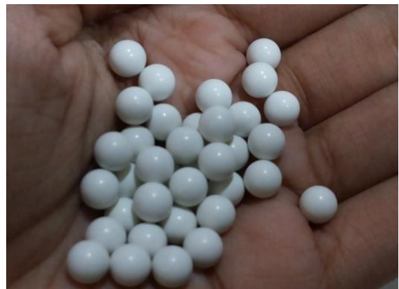
6mm Airsoft Biodegradable Plastic BBs

Physical fitness and mental wellbeing – Re-enactments are generally physically and mentally challenging, if one chooses so. Sportsmanship, stamina, leadership, endurance, adrenaline, situational awareness, problem solving, ambition, strategic thinking, determination, agility, wits and confidence are some of the requirements and benefits of the sport;